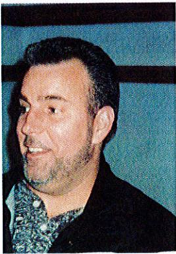
Henry J. Dunn Memorial Scholarship Fund

CWA Local 1014 6650 Browning Rd, Suite M20 Pennsauken, NJ 08109 856 541 4191